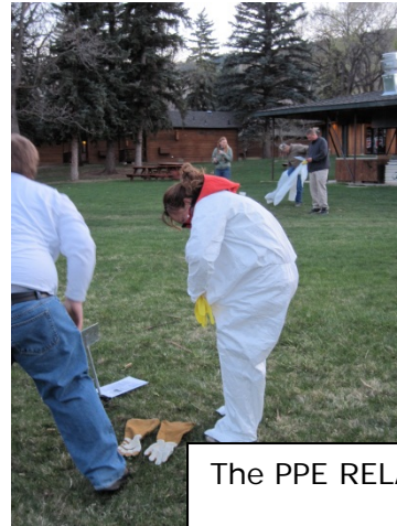
The PPE RELAY