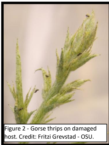
Figure 2 - Gorse thrips on damaged host.

The host-specific gorse thrips, Sericothrips staphylinus , was first permitted for field releases in November, 2019. The thrips family contains some 6,000 species, each with their own life cycle, feeding behavior, and habitats. This particular species is native to western Europe; collected in Portugal, England, and France. It has been safely utilized as a biocontrol agent in New Zealand, Australia, and Hawaii for many years. Testing conducted at Oregon State University showed the thrips cannot survive on any of 135 congeners, ornamentals, crops, and T&E plant species.