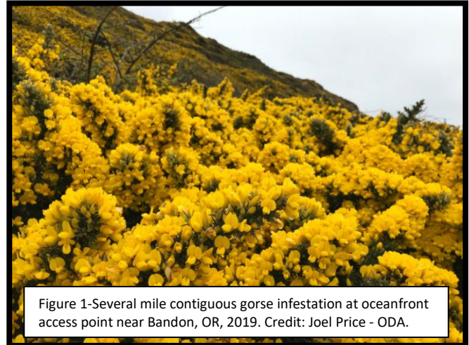
Figure 1-Several mile contiguous gorse infestation at oceanfront access point near Bandon, OR, 2019.

Native to western Europe, gorse was introduced to coastal Oregon in the 1800s for livestock containment hedging. Mature gorse plants are completely covered in sharply pointed spines. Gorse is listed as noxious along the entire western coast of the U.S., including Hawaii. The epicenter of the infestation occurs near Bandon, OR where gorse fueled a number of wildfires. Coastal homeowners express concern with rapid mechanical or chemical treatment that could potentially leave the embankments supporting their property exposed to the elements. Biocontrol is a critical tool in combating remaining infestations, with previously released agents reducing seed production ( Exapion ulicis ) or weakening plants ( Tetranychus lintearus ).